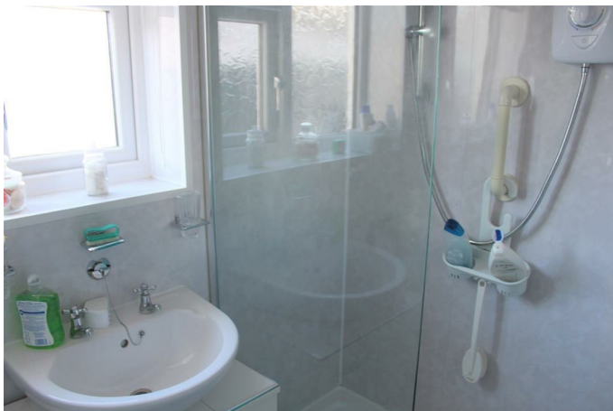
PLASTIC CLADDED SHOWER ROOM

Large shower stall with "Mira" electric shower, glass side screen, wash hand basin, close couple w.c, upvc double glazed window, ladder style towel warmer.