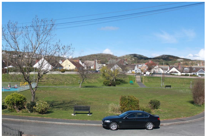
VIEW FROM FIRST FLOOR BEDROOM

Built-in wardrobes with sliding mirror doors, upvc double glazed window, radiator, view over the Green.