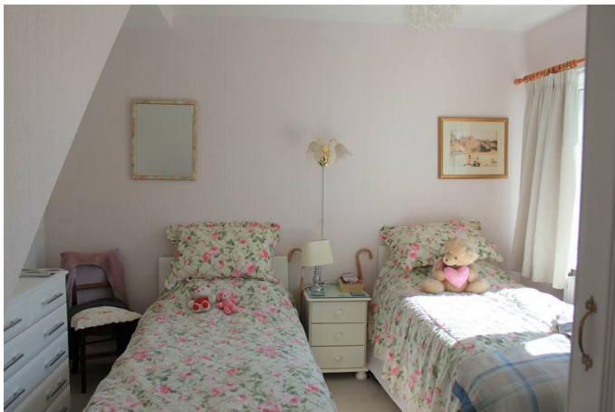
BEDROOM 1 11'11" x 11'9" (3.65m x 3.60m)

Including built-in wardrobe with sliding mirror doors, built in drawers, airing cupboard with a radiator, upvc double glazed window, double radiator.