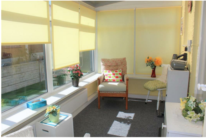
CONSERVATORY 11'11" x 6'5" (3.65m x 1.98m)

Upvc double glazed door to rear garden, double radiator, en-suite store room.