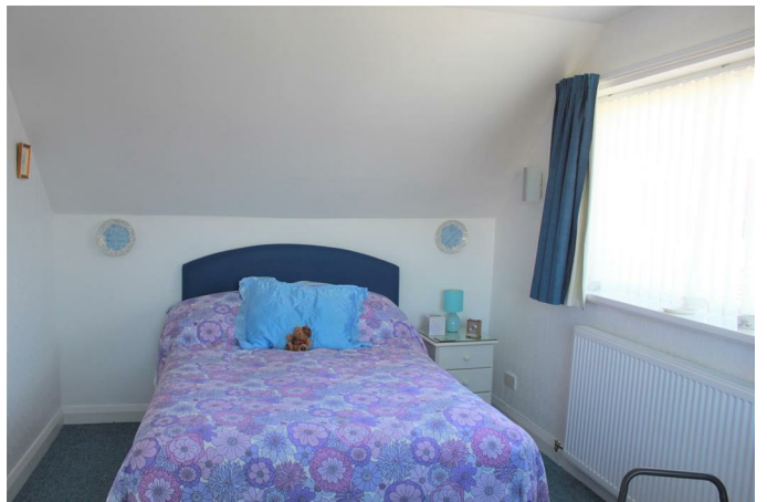
DOUBLE ASPECT DORMER BEDROOM 15'5" x 9'3" (4.71m x 2.83m)

Built-in wardrobes with sliding mirror doors, upvc double glazed window, radiator, view over the Green.