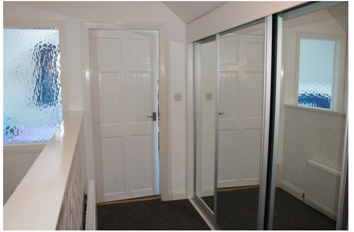
A staircase from the hall leads to First Floor la

Radiator, range of built-in wardrobes with sliding mirror doors, hanging rails and shelves.